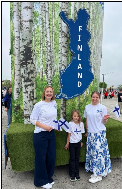
Backside of Finland's float.