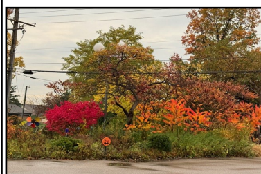
FCA receives the 2023 Beautification Award.