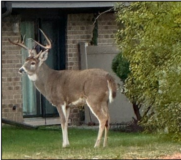
Tapiola Village had a visitor recently.