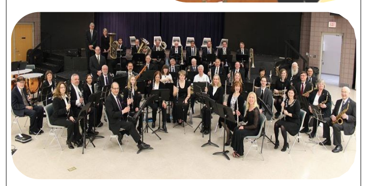
Novi Concert Band