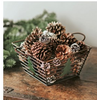
Cone Gift Basket