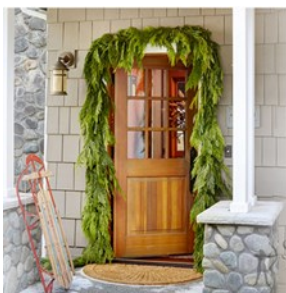
Western Cedar Garland