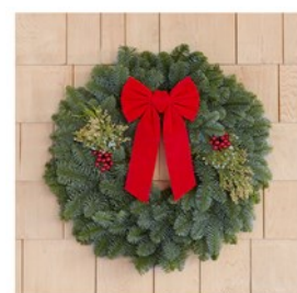
22" Mixed Evergreen Wreath