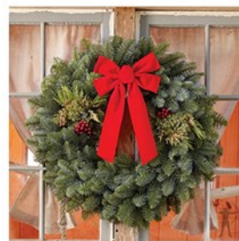
28" Mixed Evergreen Wreath