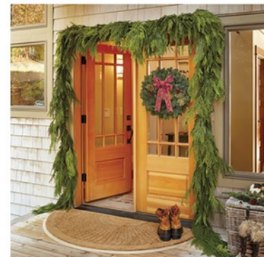
Evergreen Gift Set