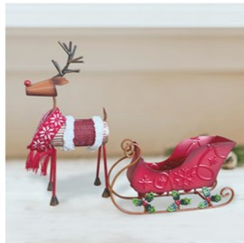
Reindeer & Sleigh Gift Set