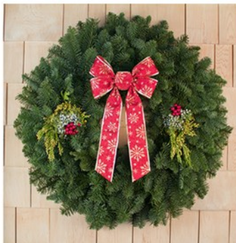
28" Mixed Evergreen Gift Wreath