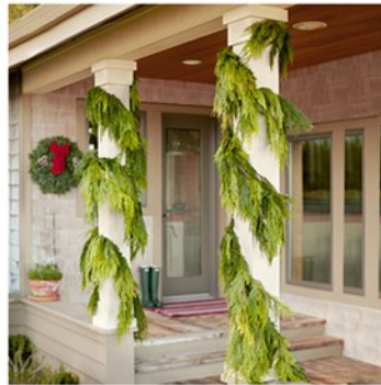
Western Cedar Gift Garlands