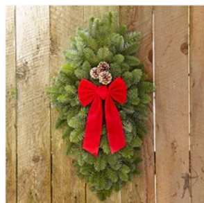
Noble Fir Door Swag