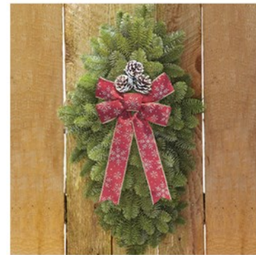
Holiday Gift Door Swag