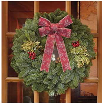
22" Mixed Evergreen Gift Wreath

Direct Delivery items will be sent to the recipient directly from Sherwood Forest Farms in Washington state within the first two weeks following Thanksgiving. Wreaths and door swag include a bow as shown and the door swag also includes white tipped pinecones, wired and ready to attach. Reindeer and sleigh are boxed. Items will include a greeting from the purchaser.