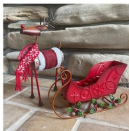
Reindeer & Sleigh Set