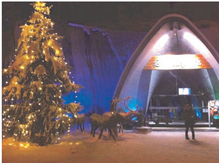
Santa Claus Village