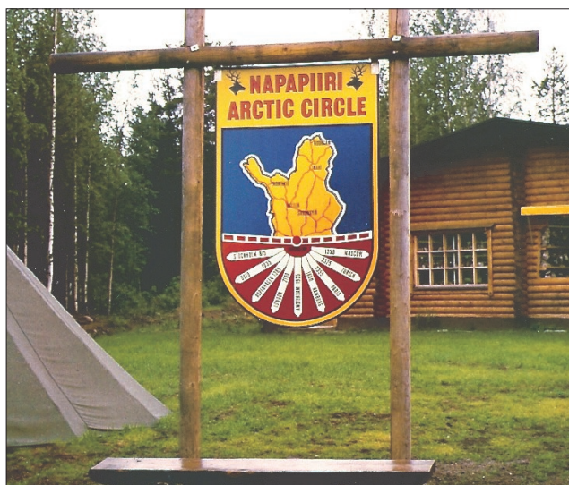
The Artic Circle