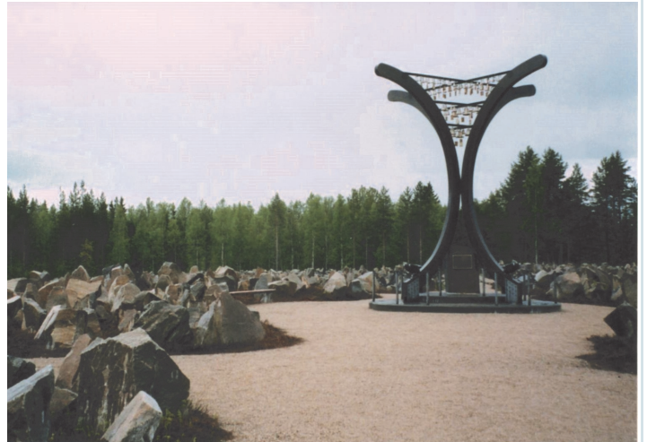
Wide Embrace Monument