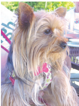
Local wildlife visits the gardens.

As you enjoy the season we wish you all "Hyvää Joulua & Hauskaa Uutta Vuotta." Thank you for all you have done on behalf of Finlandia Gardens and the FCA.