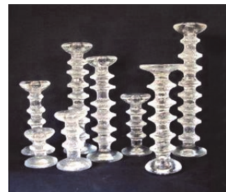
Iittala Festivo Candle Holders