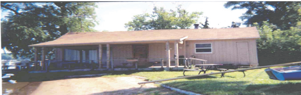
Finnish American Club at Walnut Lake