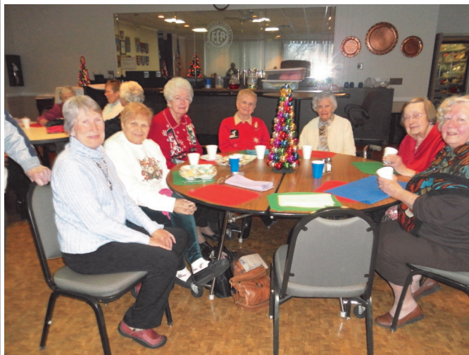
The photo depicts some of the attendees at the Christmas Potluck.

The Christmas Potluck held on December 9th was a cheerful holiday party with about 50 attendees. Once again, the pork loin baked the Finnish way with allspice and prunes, and all of the potluck dishes was delicious! The tables were decorated with the FCA’s tall trees made from Christmas ornament decorations. The members enjoy singing carols in the Finnish language. A hearty thank you to all of you who came.