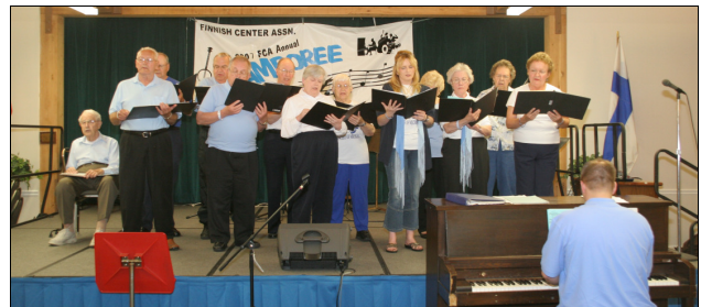
2007 Jamboree - Finnish American Singers